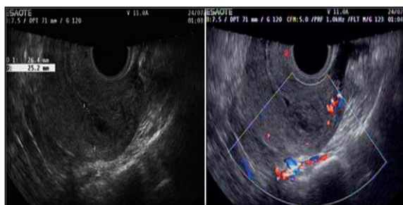
Figure 4: Transvaginal ultrasound images in a Type I PSTT: (a) demonstrating a heterogeneous echogenic mass located in the uterine cavity and (b) showing minimal blood flow at the border of the lesion on color Doppler imaging

For staging assessment, total body CT and contrast dye may be substituted by 18-fluorodeoxyglucose positron emission tomography CT-scan. MRI imaging of the brain and CT of the abdomen are recommended to those with lung metastases, which may alter staging and subsequent management.