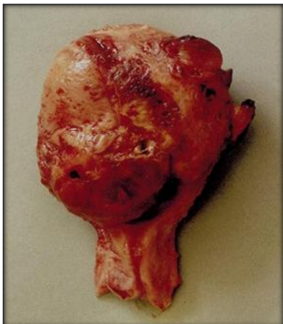
Figure 1: Hysterectomy specimen showing Placental site trophoblastic tumor, an ill- defined mass which has replaced and permeated myometrium

On histopathological examination, the tumors are characterized by gross nuclear and cytoplasmic pleomorphism of intermediate trophoblast cells. The proliferation of the intermediate trophoblastic cells evolves like nodule, which then infiltrates and proliferates between the smooth muscle cells separating them as cords and sheets (Figure 2) (Picture courtesy of Rebecca N Baergen MD). There is angioinvasion of the decidual spiral arterioles, associated with necrosis and hemorrhage. They also present monomorphic population of large polyhedral cells with irregular hyperchromatic nuclei. Nuclear atypia is usually amphophilic but can also be eosinophilic or clear. Spindling of tumor cells can be present. The occasional observation of fibrinoid deposition, if present is a typical feature of this tumour. In PSTT, neoplastic trophoblastic cells have abundant amphophilic, occasional eosinophilic or clear cytoplasm, variable nuclear size, and shape with marked hyperchromasia, nuclear grooves and pseudoinclusions. Nucleoli are generally prominent and mitotic count is usually between 2 and 4 per 10 high-power fields. [8] The endometrium adjacent to the neoplastic cells may show a pseudo decidual change.